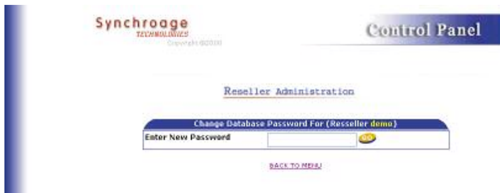
Screen Shot 7

Click on Change Password Link (in Screen Shot 5) it will give you following Screen (Screen Shot 7) where you can Enter your New Reseller Password and Click GO.