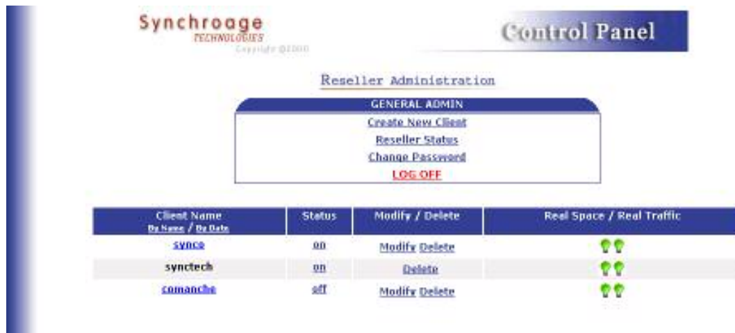
Screen Shot 5

You will get following screen after mapping a Domain. Here you can Modify or Delete a Domain. (Screen Shot 5)