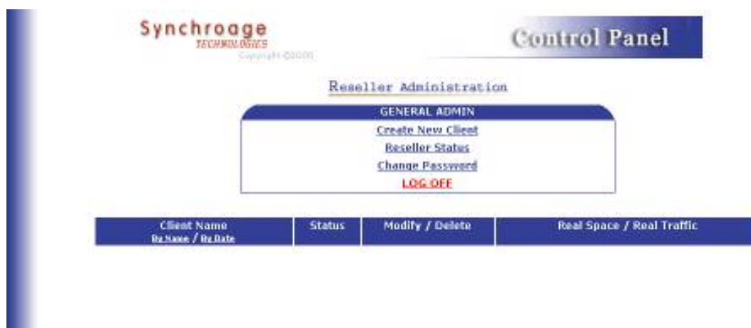
Screen Shot 2

NOTE: It is Very Important to Log Off after managing your Clients. (Security Purpose).