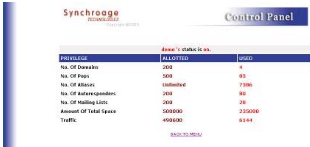
Screen Shot 6

To check you Reseller Status; Click on Reseller Status (Screen Shot 5) and you will get following Screen.