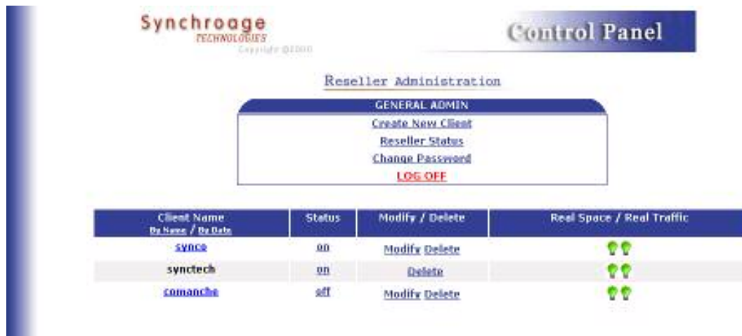
Screen Shot 5

You will get following screen after mapping a Domain. Here you can Modify or Delete a Domain. (Screen Shot 5)