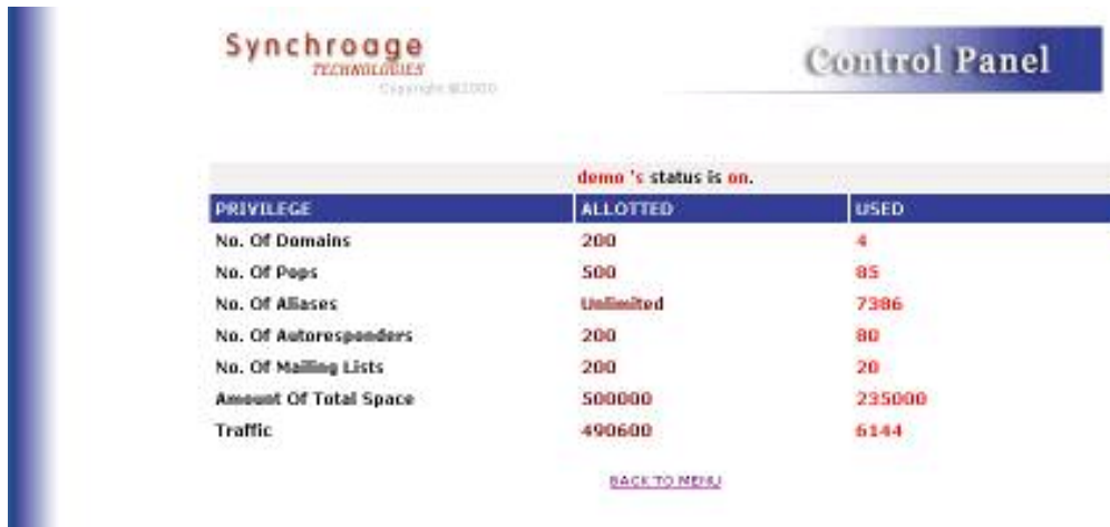
Screen Shot 6

To check you Reseller Status; Click on Reseller Status (Screen Shot 5) and you will get following Screen.