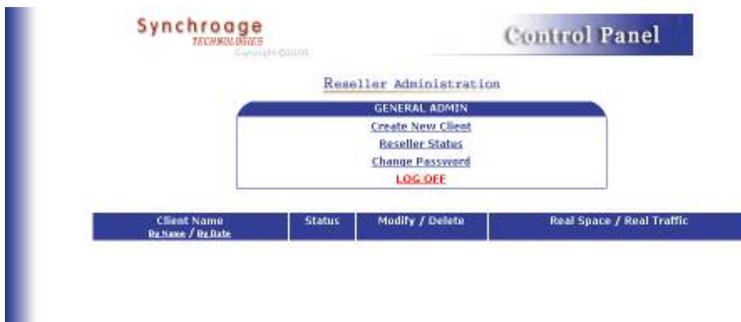
Screen Shot 2

NOTE: It is Very Important to Log Off after managing your Clients. (Security Purpose).